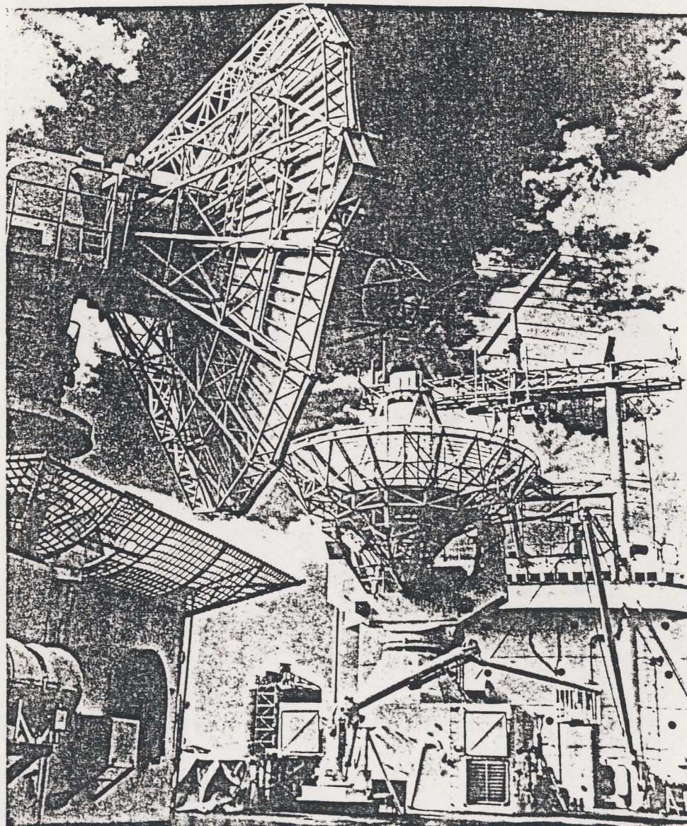
Reliable SWBC for the 80's